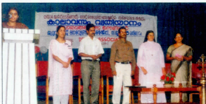
One day seminar on Climate Change organized by NSS