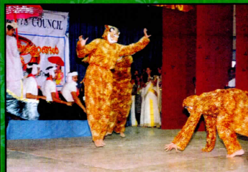
Nightingales of the English Department who bagged the first prize in "Onapattu" competition