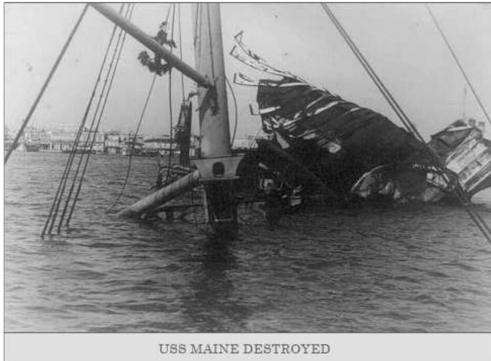
USS MAINE DESTROYED

After landing at Batabano without difficulty, on March 28th, I hurried on to Havana, fearing that it may already be too late to escape from the Island. My despatches were now dangerously compromising; so I dropped off the train in the suburbs, hoping to avoid the spies infesting the main depot.